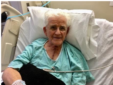
Dad - 3 days after open heart surgery!

checking in on Dad often and being his ‘chauffeur’ until he can drive again! Dad holds onto the hope he’s been given by many, that within a few months he should have a ‘new lease on life’ after a rather bumpy year!