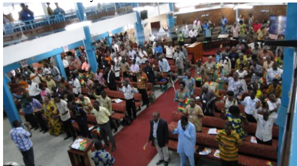
Participants in a recent Pastors' Conference