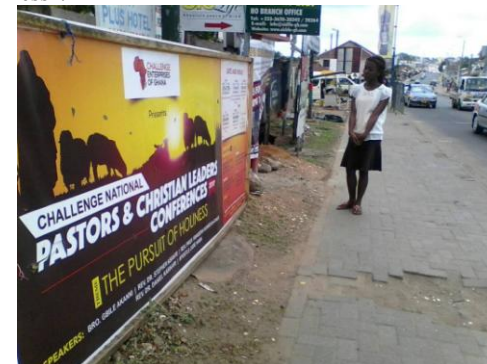
Pastors' Conference Advert in the Volta Region Capital of Ho in Ghana.

15. CEG PASTORS AND CHRISTIAN LEADERS CONFERENCES: Pray for Senior Team as they plan for this year's conferences. Pray 2017/2018 participants will put into practice what they learnt on the theme "Pursuit of Holiness".