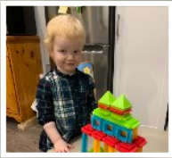
Cassidy the Builder