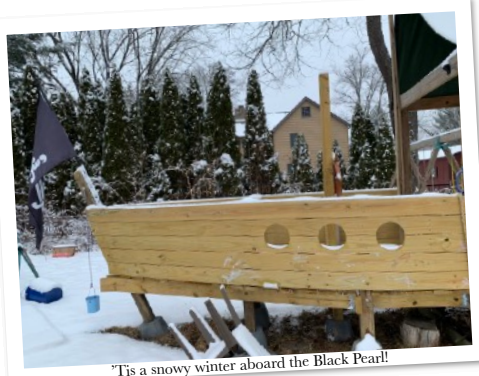
'Tis a snowy winter aboard the Black Pearl!