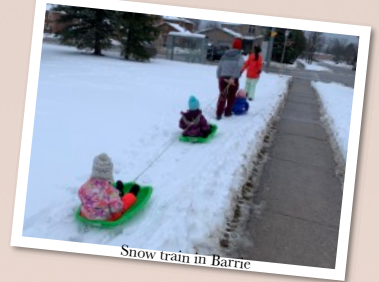
Snow train in Barrie