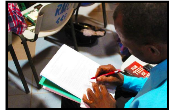
A participant taking notes at a previous National Pastors and Christian Leaders Conference

16. NATIONAL PASTORS & CHRISTIAN LEADERS CONFERENCES: The theme for the 2022 Challenge National Pastors & Christian Leaders Conferences is Healing the Wounded Earth: Sustaining the Integrity of Creation . Please pray as preparations are made for the conference.